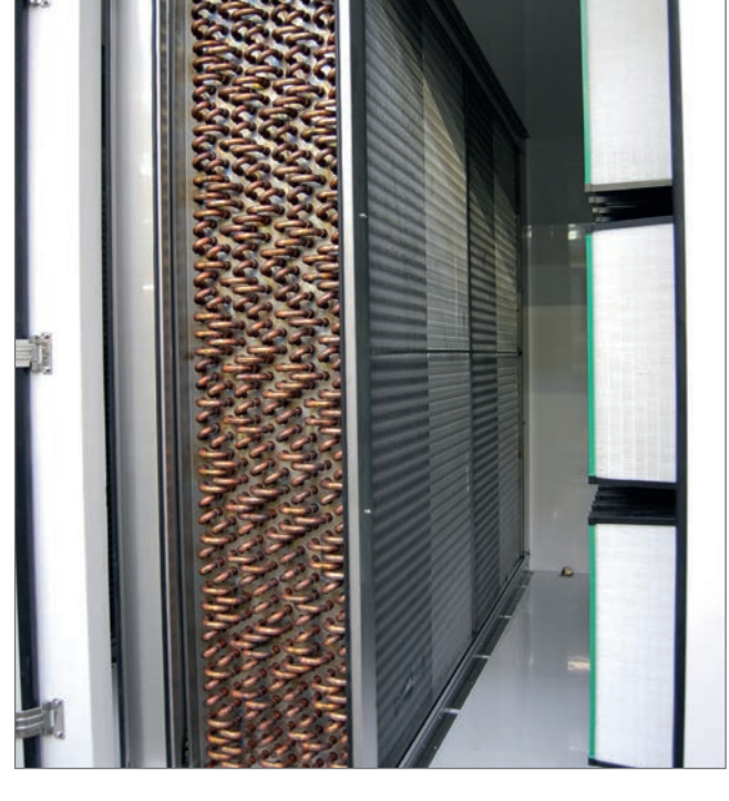
SPECIAL TREATMENT COILS

Possibility of adopting FILTER SYSTEMS of various efficiency classes (panel filters, soft bag, rigid bag filters and absolute filters) on AISI 304 stainless steel counterframes.